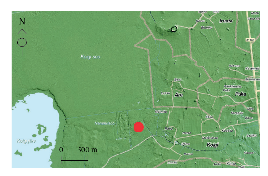
Fig. 1. The surveyed location is marked with a red dot. Jn 1. Uuritud koht on märgitud punase täpiga. Map / Kaart: Estonian Land Board / Maa-amet

The article summarizes the research conducted in 2021–2023 in Koigi, eastern Saaremaa (Fig. 1). There, a number of stone cairns spread over the territory of 18 000 m<sup>2</sup>, which had previously not caught archaeological interest. In 2021, archaeology students Mairi Kaseorg, Karin Rannaäär, and Kristo Oks from the University of Tartu (TÜ) conducted a survey to inspect those stone cairns. A trench was dug in one of the cairns, revealing a few bone fragments and a pottery sherd. The cairns are densely clustered in a slightly elevated and drier area, about 1.5 km