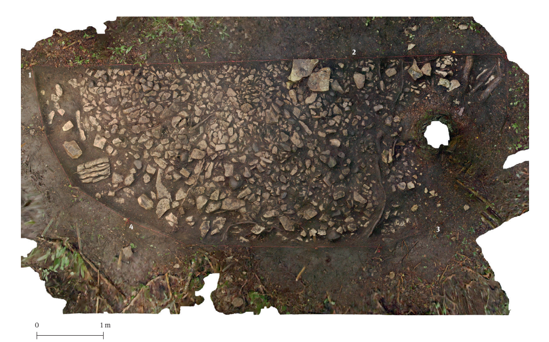
Fig. 4. The first layer of cairn no. 17. Jn 4. 17. kivivare esimene kiht.