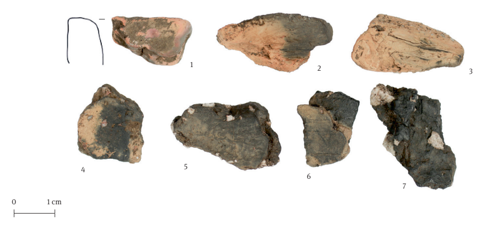
Fig. 6. Pottery from Koigi. 1–3 – examples of the fine ware, 4–7 – examples of the coarse ware. 2 – with slight striation. Jn 6. Keraamika Koigist. 1–3 – näited peenemast keraamikast, 4–7 – näited jämedamast keraamikast. 2 – nõrgalt riibitud. (SM 10925: 15 (3×), 12, 23 (2×), 16.)

The coarser pottery exhibits a composition akin to analogues found in Asva (between 900–500 BC). However, the Koigi finer sherds do not align with the composition of the fine ceramics discovered during the Asva Bronze Age excavations (Sperling 2014, 194). It should not be ruled out that those finer pieces could also be daub fragments or burned clay from walls, but it is presently uncertain.