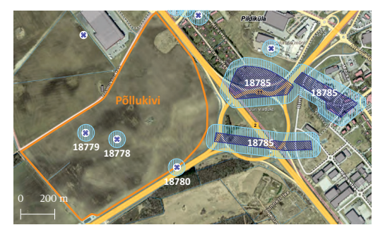
Fig. 1. Põllukivi plot with its surroundings before the investigations of 2019. Archaeological objects in the figure: 18778, 18779, 18780 – cup-marked stones, 18785 – settlement site of Lehmja. The old road is visible as a lighter stripe. The darker brown spots mark the former damp area with a turflayer.

In spring 2019, archaeological preliminary investigations were carried out in the village of Kurna in Rae municipality, Harju county. The object of the study was Põllukivi plot, located in the north-eastern part of the village, where two major highways - the Tallinn -Tartu highway and the ring road of Tallinn, cross (Fig. 1; Vedru 2019). At present Põllukivi borders with the market town of Jüri in the north-east, but previously these lands belonged to the historical Lehmja village. From the latter, the study area is separated by a modern high road running on an embankment that obstructs the view and also creates a sense of different spaces and areas. Thus the Põllukivi plot seems to be standing separately from the wider environment, but disregarding the present borders – both administrational and physical, the study area fits into its historical surroundings and becomes an integral part with its wider environment. The investigated area was not entirely a pe-