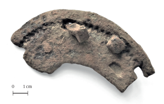
Fig. 5. Fragment of a horseshoe with a jagged groove. Jn 5. Sakilise naelasoonega hobuseraua katke (AI 8104: 17.)

Most of the finds belong to the Middle Ages and modern times. A trapezoid chain holder made of copper alloy (Fig. 4: 3) comes from a belt ornament. Copper chains hanging from a woman's belt were used mostly in the 16th–18th centuries (Kaarma & Voolmaa 1981, 224–225,