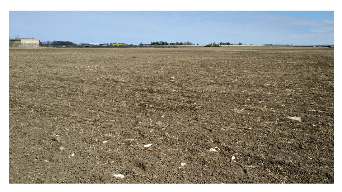
Fig. 3. View to the Early Metal Age settlement site from the south-southwest. In 3. Vaade varase metalliaja asulakohale lõunakagu poolt.