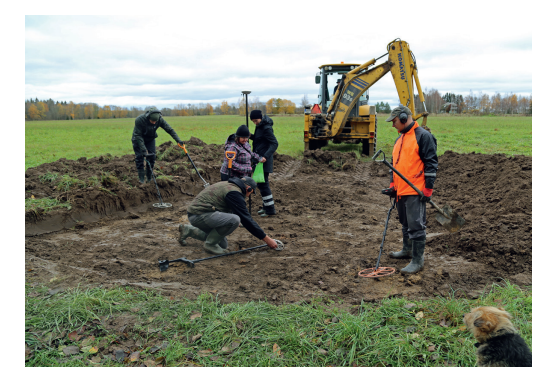
Fig.1. Excavations of the Sürgavere hoard. Jn 1. Sürgavere aarde kaevamine.

On 8 August 2019, licensed detectorist Rihet Ots informed the National Heritage Board of Estonia, that he had just discovered several silver coins in Sürgavere, Viljandi County. A few hours later, an archaeologist of the Heritage Board arrived to document the find. With the aid of a metal detector, silver coins and coin fragments were collected from an area of 38 \times 30 m. Two test pits revealed no trace of an occupational layer – the soil consisted of 25-40 cm thick mixed ploughed layer, situated on the natural loam. Later, R. Ots handed over coins and coin fragments with location data from the site on several occasions, most recently in August 2020.