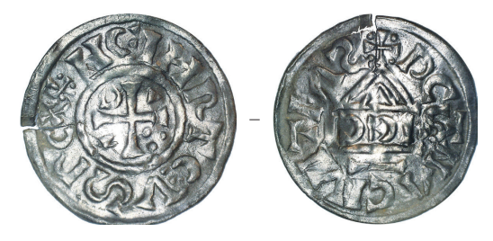
Fig. 4. Regensburg, Henry II, 1st rule (1002–1009). Jn 4. Regensburg, Heinrich II, 1. periood (1002–1009).

king Cnut in the find – two of the Quatrefoil type, one of the Pointed helmet type and one of the Short cross type (Fig. 5). The two latter are the most recent among the western coins, struck ca. 1023–1029 and 1029–1035, respectively.