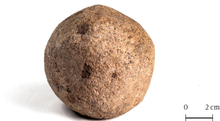
Fig. 2. Grinding stone from the Värtemäe hill fort. Jn 2. Jahvekivi Värtemäe linnamäelt. (TÜ 2670: 100.)