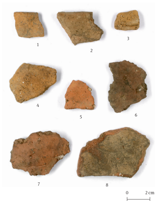
Fig. 3. Pottery from the Värtemäe hill fort.