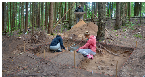
Fig. 1. Trench of 2017 on the Värtemäe hill fort. Jn 1. 2017. aasta kaevand Värtemäe linnamäel.

The dark eroded top soil contained some tiny fragments of hand-made pottery. In the depth of 12–15 cm it was followed by light yellowish brown disturbed sand with some dispersed fire-cracked stones, also of eroded character. From this layer a grinding stone with strongly worn surfaces (Fig. 2) was found. In the