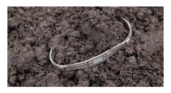
Fig. 5. Fully preserved bracelet in situ. Jn 5. Tervena säilinud käevõru in situ. (AI 7450: 1.)

In addition to coins fifteen finds of various ornaments were also discovered, with a total weight of 111.6 grams. The heaviest was a bracelet with open ends (45.1 g), which is also the only entirely preserved adornment (Fig. 5). The remaining 14 objects are fragments of several jewellery items of different size and weight (Fig. 6). The type and form