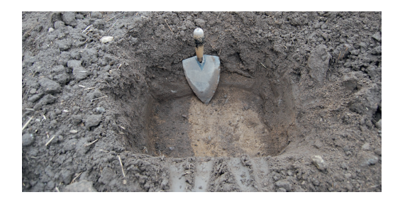
Fig. 1. Trace of ploughing appeared on the light moraine. Jn 1. Künnijälg heledal moreenil.