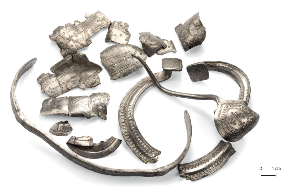
Fig. 6. Silver ornaments from the Soomevere hoard. In 6. Soomevere aardes sisalduvad hõbeehted. (AI 7450: 1–14.)

could be determined for four fragments from a peak-arched penannular brooch and a pin belonging to the same artefact, eight fragments from two thin open-ended bracelets and one fragment of a silver sheet pendant. Similarly to coins, the ornaments are broken and deformed due to tillage and the weight of the soil. The hoard contained no intentionally fragmented ornaments or hack silver.