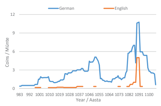
Fig. 5. A diagram showing the chronological distribution of German and English coins of the Kukruse hoard. Jn 5. Kukruse leiu Saksa ja Inglise müntide ajalise jaotuse diagramm.