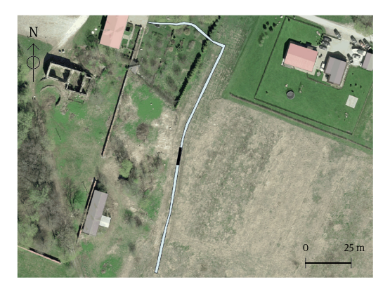
Fig. 3. The location of the trench for the geothermal heating pipes (blue). Dark line marks the area where the coin hoard was found.

Archaeological fieldwork was conducted on September 23rd and October 4th. A one metre wide trench had already been excavated to the depth of the existing geothermal heating pipeline (about 80 cm). The eastern profile of the ca . 150 metres long trench was cleaned and the visible pits documented by photos and GPS-coordinates. Subsequently the trench was deepened to the depth of one metre and the bottoms of the pits, which had not been visible at the level of 80 cm, were cleaned, documented and finds were collected (AI 7651). Unfortunately, none of the pits could be connected solely with the Late Iron Age habitation. Even if potsherds were found from the pit, these were always accompanied by recent materials (plastic, green-house glass etc.).