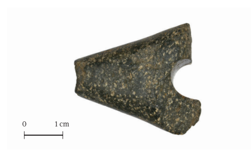
Fig. 2. Fragment of a sharp-oval battle-axe from the Kukruse settlement.

Occupation layers of all sites revealed dozens of pottery sherds and single metal objects. Sherds from the Kukruse settlement included both hand-moulded and wheel-thrown samples, although clearly Medieval sherds were missing. Some sherds from the Kukruse settlement represented the same kind of pottery that was found from the cemetery (e.g. TÜ 1814: 4, 6, 9), but the different profile of rims (e.g. TÜ 1814: 3, 5, 13) implied a higher variation of different vessels in the settlement. Some sherds of stoneware from the Kukruse manor site (TÜ 1814: 48–52) associate with the medieval and modern age manor.