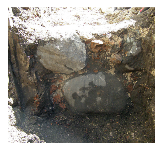
Fig. 4. Probable town wall in the Pühavaimu street. View from the north.

Jn 4. Arvatav linnamüür Pühavaimu tänaval. Vaade põhja poolt.