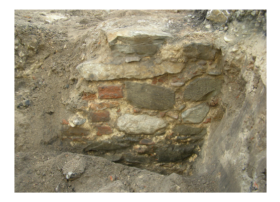
Fig. 3. St Nicholas Church. Southern section of the western wall. View from the west.

As the whole area was dug empty before erecting the apartment building, the number of bones, found from the area east to the church was very low. Single bones that were found on the northern side of the present Pikk street suggest that the area with burials may once have reached up to this point.