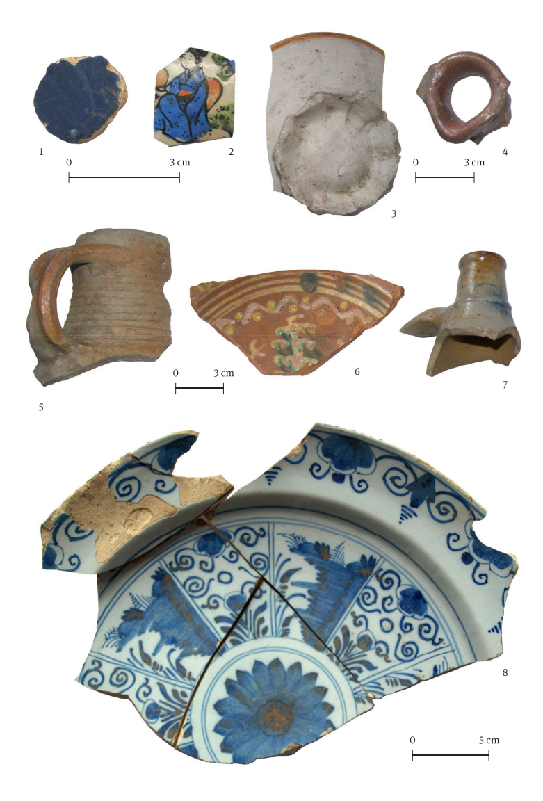
Fig. 5. Ceramics from Pärnu. 1 – gaming piece made from a faience vessel sherd, 2 – 19th-century faience sherd, 3, 5 – Siegburg and 4 – Lower Saxony stoneware fragments from the 14th – 15th centuries, 6 – red slipware sherd, 7 – stoneware mineral water bottle fragment and 8 – pieces of Delftware platter, all from the 18th century.

Fragments of 15th – 18th century glazed redware and whiteware of North Germany and Low Countries were also found, including some sherds of tripod pipkins and slipware (Fig. 5: 6; Heege 2002, 269–270, figs 567, 569; Russow 2006, 97–98). Similar ceramics have been found from Pärnu also during earlier archaeological fieldwork (Russow 2006, 164ff.;