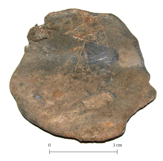
Fig. 6. A piece of tin with scratched motif, found from the Malmö street.

Jn 6. Sissekraabitud kujutisega tinatükk Malmö tänavalt. (PäMu 27485 A 2680: 27.)