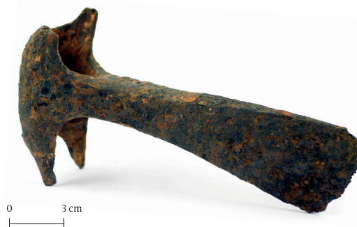
Fig. 6. Narrow-bladed axe with broad poll from Kirumpää (no. 106).

Jn 6. Kitsateraline laia kannaga kirves Kirumpäält. (TÜ 2359.)