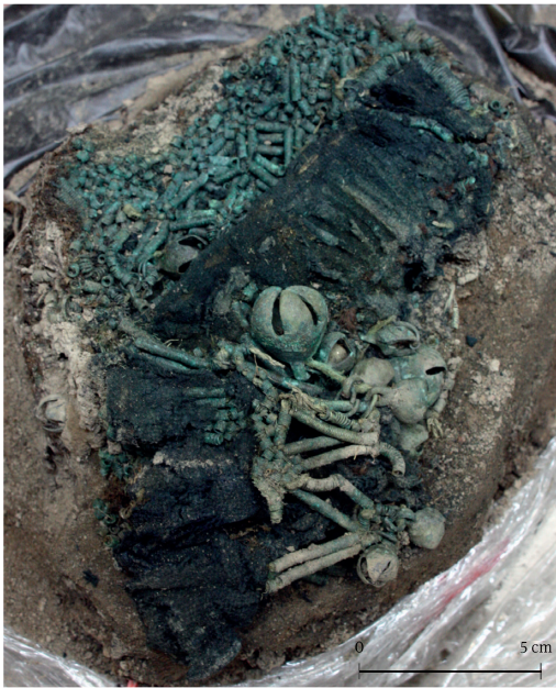
Fig. 7. Kivijärve hoard (no. 29) consisted of a birch bark box filled with numerous spiral tube decorations, partly edged with bells. Also remains of a blue textile item made of wool were preserved, possibly originating from a festive head dress.

Jn 7. Kivijärve peitleid koosnes kasetohust vakast, mis oli täidetud erinevate spiraalitorudest muustritega, mida ääristasid kuljused. Samuti oli säilinud jäänuseid sinisest villasest tekstiilist, mis võivad pärineda pidulikust peakattest.