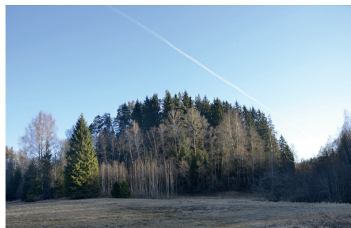
Fig. 3. Madsa Liinumägi hill fort (no. 91).

Jn 2. Arheoloogid otsivad leide Pühi Kiisa asulakohal.