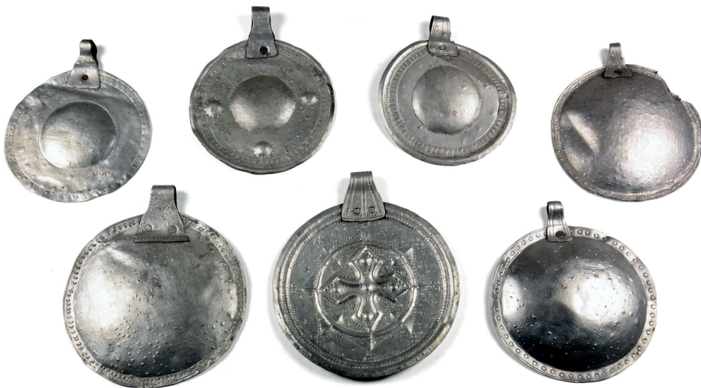
Fig. 4. Bracteate pendants from Konju hoard (no. 17).