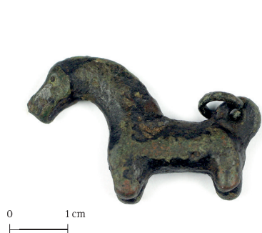
Fig. 5. Small horse figurine of copper alloy found in Varbuse (no. 49).

In addition to the hoards mentioned above (particularly in the paragraphs about Harju and Ida-Viru Counties), in southern part of Estonia four assemblages dating from the 16th–17th centuries (nos. 29, 67, 90, 94) and one from the Viking Age were discovered (no. 101). A unique find assemblage was detected by A. Keske at Kivijärve (no. 29). The whole find assemblage was removed from the earth as a block (i.e. together with supportive soil) by