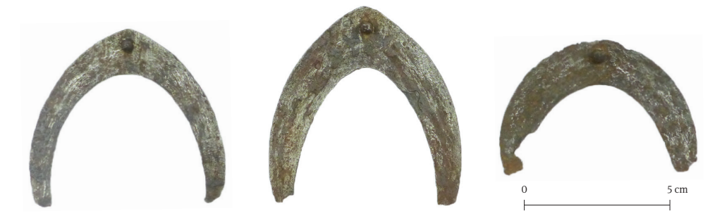
Fig. 6. Shoe fittings from the 16th and 17th century from different cultural layers on Kivi street. Jn 6. 16. ja 17. sajandi kontsarauad erinevatest Kivi tänava kihistustest. (TM A-220: 177, 682, 483.)

side-by-side, each 40–65 cm in diameter. Some of the logs were unworked (even unpeeled), others were processed (hewn, painted, etc.) and therefore, they had been reused.