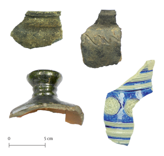
Fig. 5. Ceramics from the 15th – 18th century from different cultural layers on Kivi street.

Jn 5. 15.–18. sajandi keraamika erinevatest Kivi tänava kihistustest.