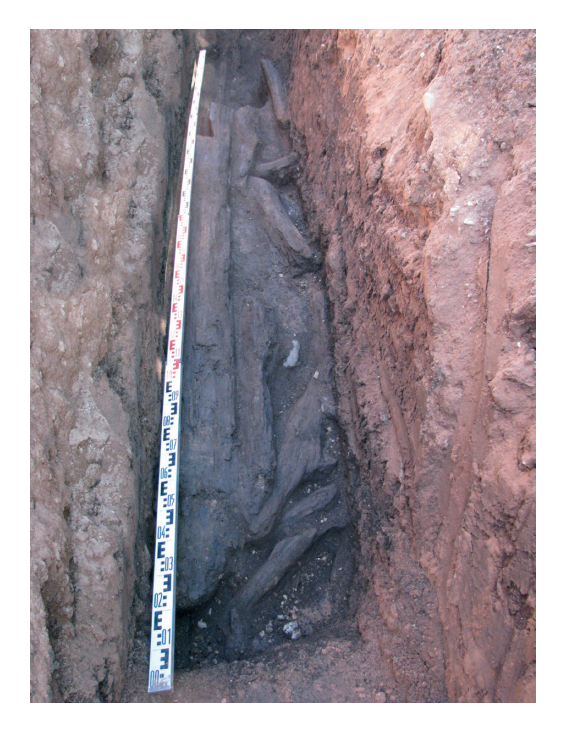
Fig. 4. Wood from a demolished Medieval building used to cover the street. Presumably laid during the first half of the 18th century.

Jn 4. Kivi tänava katteks tõenäoliselt 18. sajandi esimesel poolel laotatud keskaegse hoone lammutuspuit.