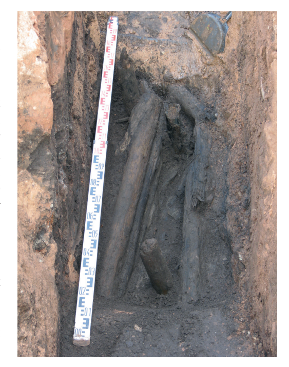
Fig. 7. Drainage trough, presumably built during the Medieval period.

The results of the 2014 research support the hypothesis that Kivi street has developed already during the Medieval period. The probably oldest drainage systems that have been inspected, several archaeological finds from later cultural layers, and a radiocarbon sample from a log used as infilling on the street have all been dated to the same period. During the Medieval and Early