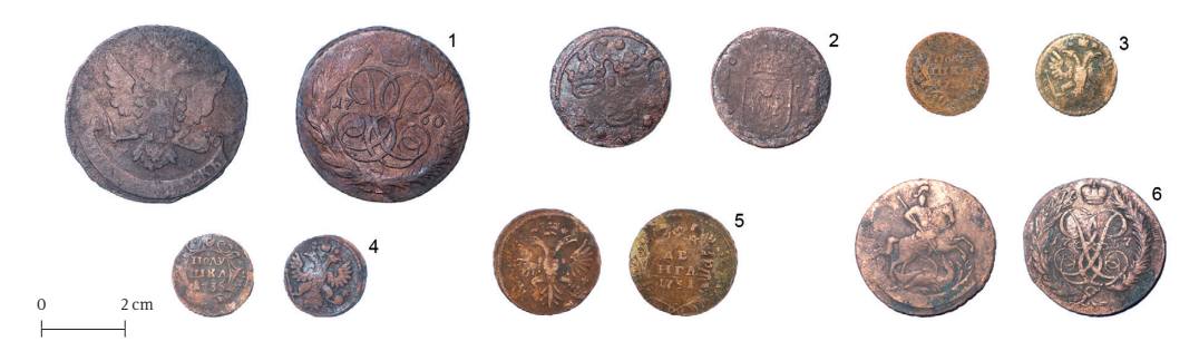
Fig. 3. Coins found during the excavations on Kivi street. 1 – Russian Empire, Jelizaveta Petrovna, 1760, 5 copecks, between the layer of asphalt and the upper cobblestone pavement, 2 – Swedish Empire, Christina, 1636, ¼ öre, between the buildings at Kivi St 57 and 65 on the site of a quondam courtyard, 3 – Russian Empire, Anna Ioannovna, 1737, polushka, cultural layer underneath the oldest cobblestone pavement in front of Kivi St 53, 4 – Russian Empire, Anna Ioannovna, 1735, polushka, cultural layer between the two layers of cobblestone pavements in front of Kivi St 40a, 5 – Russian Empire, Anna Ioannovna, 1731, denga, cultural layer underneath the oldest cobblestone pavement in front of Kivi St 53, 6 – Russian Empire, Jelizaveta Petrovna, 1757, 2 copecks, cultural layer underneath the oldest cobblestone pavement in front of Kivi St 40a.

More than 0.5 m below the pavement described above there was another layer of pavement – the older cobblestone pavement of Kivi street. It comprised of round igneous and metamorphic cobblestones that were laid in an irregular manner on top of the soil rich in humus without sand bedding. The average diameter of the stones was 20 cm. Based on the coins from the 1730s that were found from underneath the pavement and coins from the 1730s–1750s that were found in-between the stones (Fig. 3), the cobblestone pavement was laid during the second half of the 18th century.