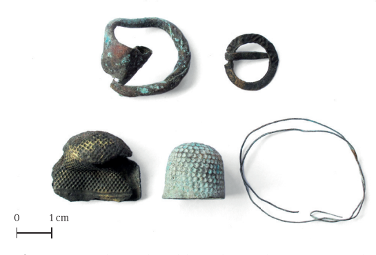
Fig. 5. Brass objects found from the south-west corner of the quarter.