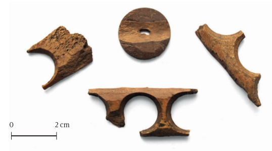
Fig. 11. Residue of bone crafting from the northeast-southwest ditch in the south corner of the quarter.

Jn 11. Luutöötlemisjäägid kvartali lõunanurga kirdeedela-sihilisest kraavist.