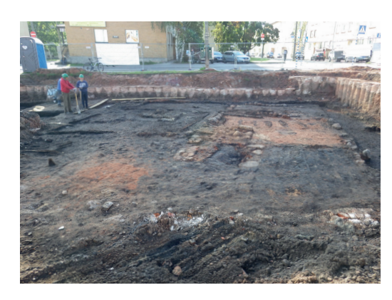
Fig. 7. Three-room building from the 18th century. View from the north-west.

The cultural layer that designated the second usage period of the building was in the entire excavation area covered by debris soil. This fill was brought to the area after the Great Northern War. On the levelled ground a larger dwelling building with at least three separate rooms had been erected (Fig. 2: 17; 7). The contours of the building could be read from foundations made of medium or small size field stones and occasional bricks, later construction activities had severely damaged the basement which therefore had survived only in fragments. Considering the modest load capacity of the stone basement, the building had probably been a timber construction. The west, south and east side of the building could be distinguished, the