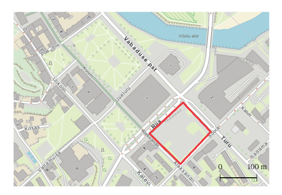
Fig. 1. Location map of the investigated area (plot of the old department store) in Tartu.

used during archaeological excavations to remove the upper debris layers, the filler deposits of the ponds and the stone constructions of buildings that had been destroyed during World War II until archaeologically valuable layers. From there the soil was studied manually until the natural peat layer, which towards Aleksandri street was located at absolute height 34.90 m, and towards Turu street at absolute height 33.90 m a.s.l. In total an area of 1330 m<sup>2</sup> was studied (Fig. 2), the work was conducted by archaeologists Rünno Vissak, Eero Heinloo and Silja Möllits from MTÜ AEG. Find material collected during the excavations will be handed over to Tartu City Museum (collection number TM A-221).