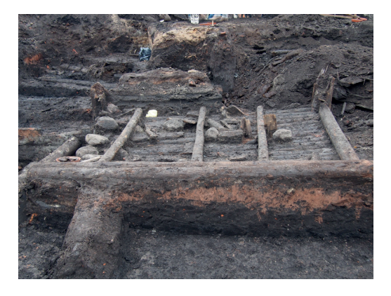
Fig. 6. Base of the earliest building (end of the 14th century) found in the quarter. View from the north-east. Jn 6. Kvartali varaseima, 14. sajandi lõpul rajatud hoone

alus. Vaade kirdest.