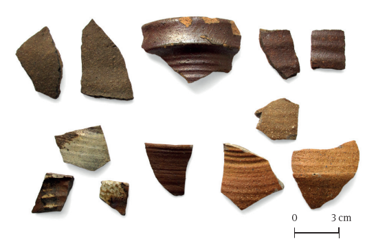
Fig. 4. Proto- and near-stoneware from Siegburg, nearstoneware and stoneware from South Lower Saxony. Jn 4. Siegburgi protokivi- ning varakivikeraamika, Lõuna-Alam-Saksi varakivi- ja kivikeraamika.

Reddish loam extended against the lower logs of the west and south sides of the new building, hence connected with the usage period of the building. Right below the loam