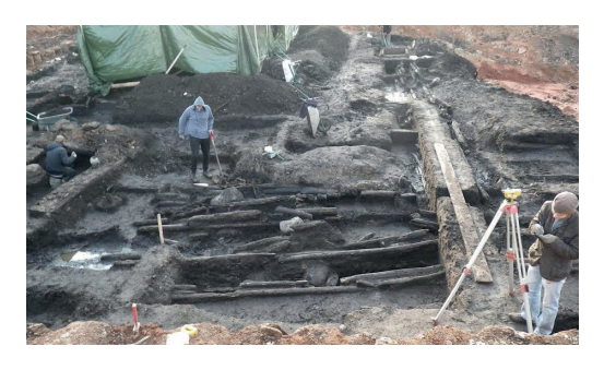
Fig. 9. Area of ditches in the western side of Turu street. View from the east.

The earliest of the drainage systems (Fig. 2: 7) was a ditch that demonstrated two stages of usage. The depth of the gently slanting ditch dug at the earlier period was 45–50 cm, its width was 1.9–2 m. At a later stage another 60 cm wide ditch had been dug at the same location into the depression