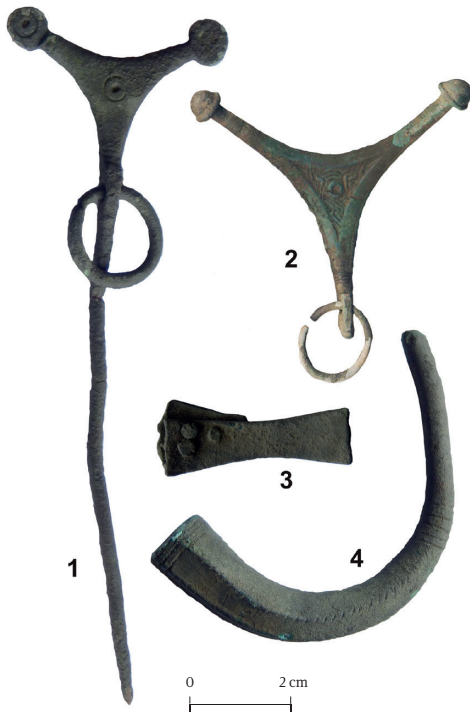
Fig. 6. Bronze artefacts from Viidumäe.