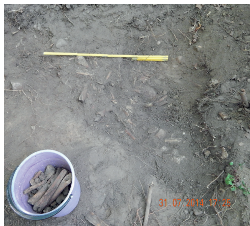
Fig. 8. Human bones in an oval pit, view from the north. Jn 8. Inimluud ovaalses lohus, vaade põhja poolt.

Human sacrifices near a big temple in Old Uppsala, central Sweden, are described by Adam of Bremen and Saxo Grammaticus. Although the earliest of these writings can be dated no earlier than to the 11th century, the authors refer to pre-Christian, that is, Viking Age society.