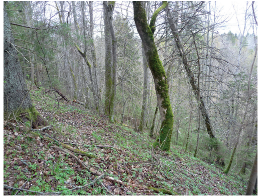
Fig. 2. View to the sacrificial site from top of the cliff.

On the slope and near the foot of the cliff light-yellow sand was found everywhere right below the turf. All finds had been stuck into the sand and came into light from the sand surface or a few centimetres below it. It suggests that the cliff, in the time when it was used as a sacrificial place, was not covered with trees and bushes as it appears today, but instead lay barren and sandy. The light yellow and steep cliff could, accordingly, have been an even more impressive site in prehistory than now (Fig. 2). The sand layer could be observed as far as 7–8 m from the foot of the cliff. At an even lower level, around the wetland, the surface consisted of gravel covered with a thin layer of turf.