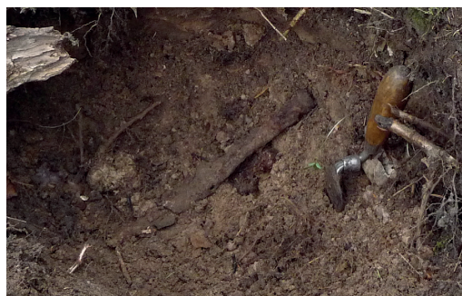
Fig. 5. Spearhead found in one of the pits dug by illegal detectorists.

Jn 5. Ühest ebaseaduslike metallidetektoristide kaevatud august leitud odaots.