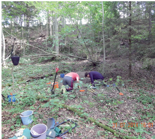
Fig. 7. View to the trial excavation, where human bones were uncovered, from the north-west.

Jn 7. Vaade inimluude leiukohale ja proovikaevandile loodest.