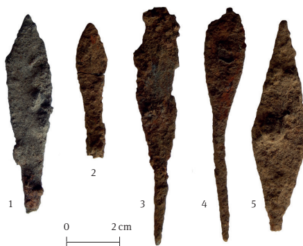
Fig. 4. Arrow-heads from Viidumäe.