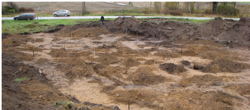
Fig. 1. Aranküla burial site before the salvage excavations in October 2009 after the road works were stopped and police inspected the site. Discovered burials are marked by pegs. View from the north.

In autumn and winter 2009 archaeological salvage excavations were carried out in the Aranküla village (Rapla parish) in the County of Raplammaa. A previously not known early modern pit-grave cemetery was discovered during the reconstruction work carried out at the crossing of the Tallinn–Rapla (road No. 15) and Aranküla–Juuru road (T-20123) (Figs 1–2). 1 Some human skeletons had been discovered by the road builders and the work was stopped for archaeological investigations. The site was known by local inhabitants as a place where some people had been buried during the World War II. Inspection by local police officials brought to light some Soviet Red Army equipment, but archaeologist Armin Rudi, Raplammaa county inspector of the National Heritage Board, also found a glass bead which hinted at the existence of a village cemetery dating