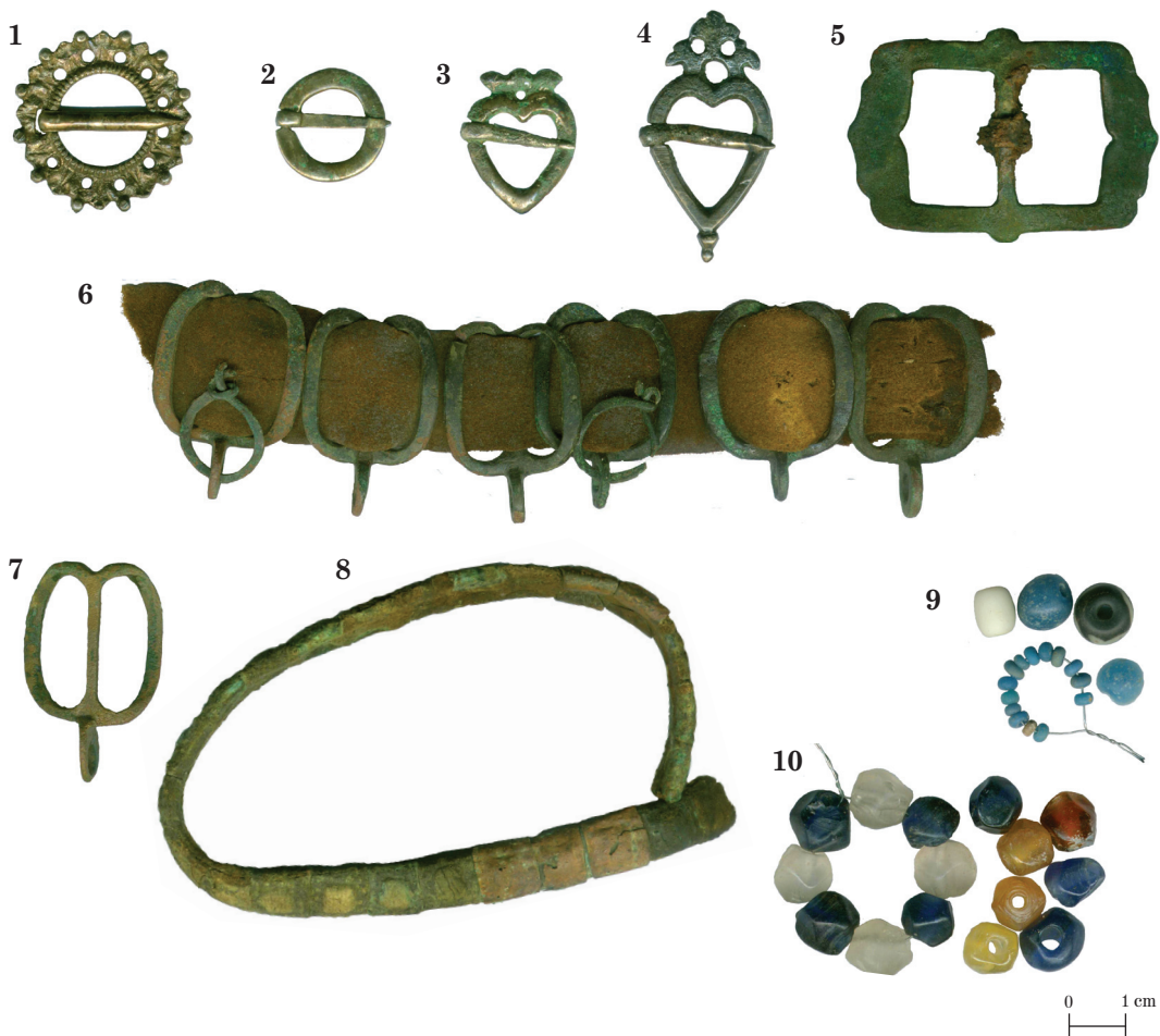
Fig. 4. Finds from Aranküla cemetery. 1–4 silver brooches, 5 – bronze buckle, 6 – leather belt with bronze links, 7 – bronze link of a leather belt, 8 – studded bronze rim of leggings, 9–10 – glass beads.

Jn 4. Aranküla kalmistu leide. 1–4 – hõbesõled, 5 – pronkspannal, 6 – pronkslülidega nahkvöö, 7 – nahkvöö pronkslülü, 8 – sääraste pronksnaastudega kaetud serv, 9–10 – klaashelmed.