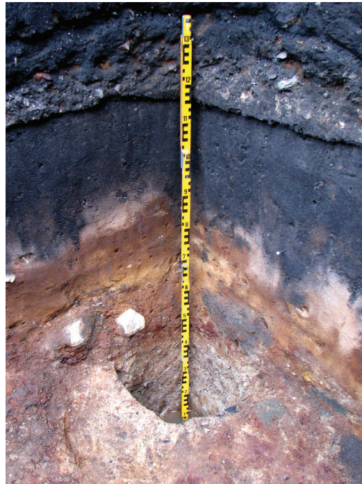
Fig. 3. The south-western corner of the excavation plot of 2010.

One of the most important discoveries from the site was a 15–20 cm thick layer, consisting of blackened sand, animal bones, and fragments of hand-made ceramics. The concentration of the pottery fragments in the pit was outstanding as altogether 45 fragments were found. The probable date of the potshards was consulted with several specialists. Although the specialists proposed different periods, they all agreed with the Iron Age dating of the pottery fragments. 5 Two specialists (Valter Lang and Mare Aun) assumed that at least some of the pottery fragments originate from the Early Iron Age. The fragments are with