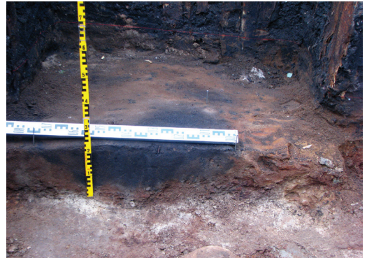
Fig. 4. The eastern half of the household pit from the west.

The inner and outer surfaces of the shards have been smoothed. Two shards have been slightly striated. Six shards have ornaments, deriving from probably four vessels.