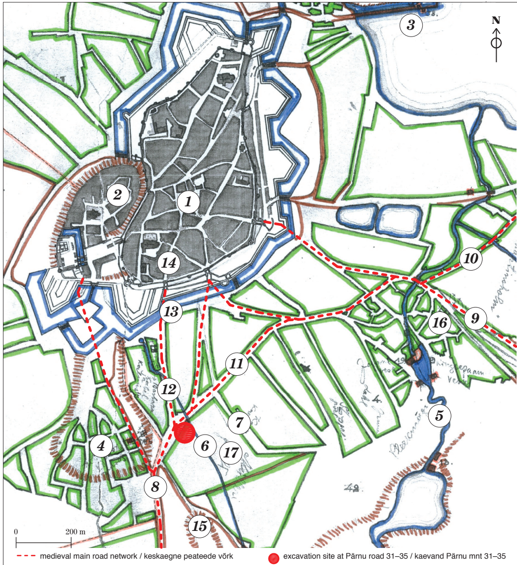
Fig. 1. 1 – Town Hall Square, 2 – Toompea hill, 3 – harbour, 4 – Tõnismägi hill, 5 – former River Härjapea, 6 – water conduit from Lake Ülemiste to the Old Town, 7 – Karja spring at Tatari St 24, 8 – road to Pärnu, 9 – road to Tartu, 10 – medieval road to Narva, 11 – Sakala St, 12 – Roosikrantsi St, 13 – present Vabaduse Square, 14 – Harju St, 15 – medieval execution site Võllamägi ('Gallows Hill'), 16 – medieval St John's almshouse, 17 – Müller's field in the 17th century.

Jn 1. 1 – Raekoja plats, 2 – Toompea, 3 – sadam, 4 – Tõnismägi, 5 – kunagine Härjapea jõgi, 6 – veejuhe Ülemiste järvest vanalinna, 7 – Karjaallikas Tatari tn 24, 8 – Pärnu mnt, 9 – Tartu mnt, 10 – kunagine Narva mnt, 11 – Sakala tn, 12 – Roosikrantsi tn, 13 – Vabaduse väljaku asukoht, 14 – Harju tn, 15 – keskaegne hukkamispaik Võllamägi, 16 – keskaegne Jaani seek, 17 – Mülleri põld 17. saj.