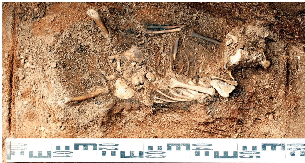
Fig. 7. Burial no. 24.