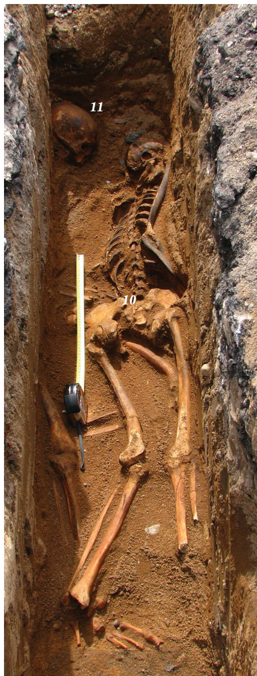
Fig. 6. Burials nos 10 and 11.

During archaeological monitoring, 28 burials that were at least partially intact could be identified. All but one that was left intact could be analysed (Table 1). Five burials (nos 6, 8, 9, 10, 11) could be studied to their full extent, and 22 partially. Among the burials found in situ , six were male, six female and 13 sub-adults. In addition, one of the burials could be a woman, suggested by the small size and gracility of the bones and the other was another adult. Due to the fragmentation of the collected bones, definitive determination was not possible. A large amount of disturbed human bones had