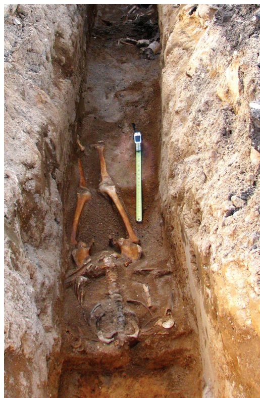
Fig. 2. Burials nos 6, 7 and 8 in trench no. 2. Jn 2. Matused 6, 7 ja 8 trassis nr 2.

Investigations were interrupted by longer breaks and some unexpected fallbacks arose. The coordination of the schedules of archaeologists and road constructors presented some difficulties. The article looks into the results of the investigations, reflects on the problems experienced during fieldwork, and estimates the solutions reached.