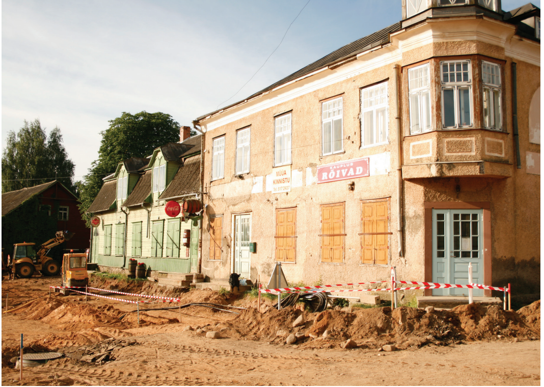
Fig. 3. Overview of the investigation area in August.