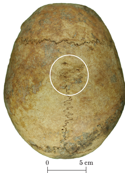
Fig. 8 Male cranium with healed depressed trauma. Jn 8. Paranenud lohukujuline trauma mehe koljul.

From the palaeopathological viewpoint, several diseases and traumas were identified (see Table 1), which were determined according to Ortner and Putschar (1985) and Steinbock (1976). Among the disturbed bones, a male cranium (age at death 30–40 years) could be pointed out. Traces of a healed trauma could be distinguished on his cranium vault, above the sagittal suture connecting the parietal bones (Fig. 8). Such hollow-shaped cranial fractures are usually caused by blunt force traumas. In the case of the man buried at Mustla, parts of the neurocranium had been forced inwards, but the trauma had not been lethal and the person had healed from it. This can be seen from the round edges of the wound. In the case of two skeletons, healed fractures of bones could be distinguished.