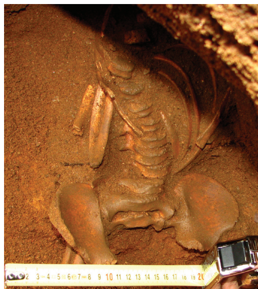
Fig. 4. Burial no. 3. Jn 4. Matus 3.

A coin of Erik XIV, minted in 1564 3 (Fig. 5: 2) was found in the southern profile of trench 4. It cannot be associated with a definite burial, although there were bones in the profile as well. A piece of (probably linen) cloth (Fig. 5: 4) was discovered with the coin.