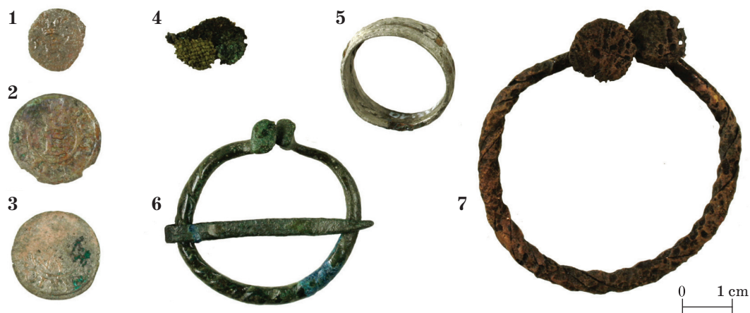
Fig. 5. Items found from the cemetery. 1–3 – coins, 4 – textile fragment, 5 – finger ring, 6–7 – penannular brooches.

Jn 5. Kalmistult leitud esemed. 1–3 – mündid, 4 – tekstiilikatke, 5 – sõrmus, 6–7 – hoburaudsõled. (TÜ 1833: 7, 8, 9, 8a, 2, 11, 10.)