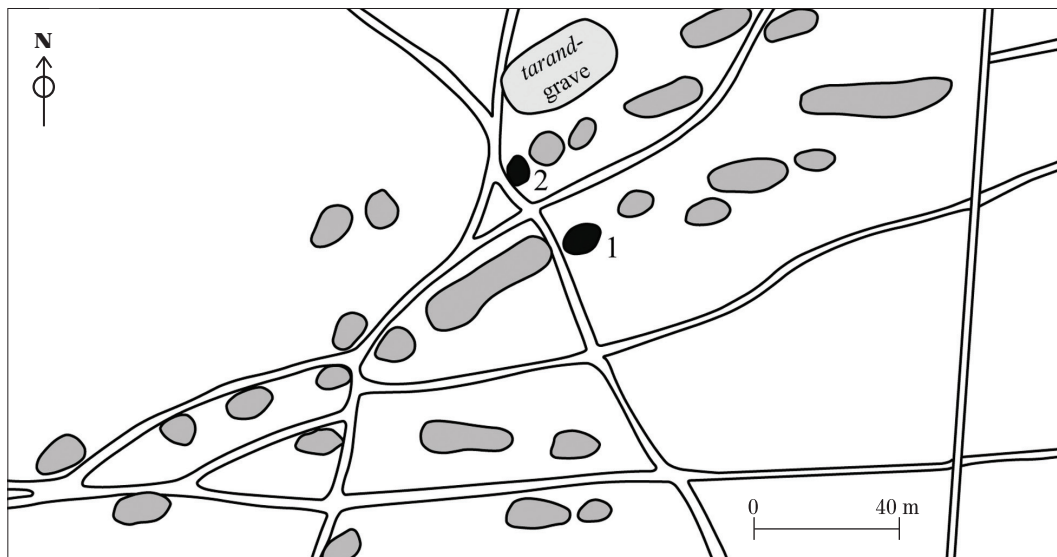
Fig. 3. Plan of the Loosi barrow cemetery (after Laul 1972, fig. 3).

Jn 3. Loosi kääbaskalmistu plaan (Laul 1972, jn 3 alusel).