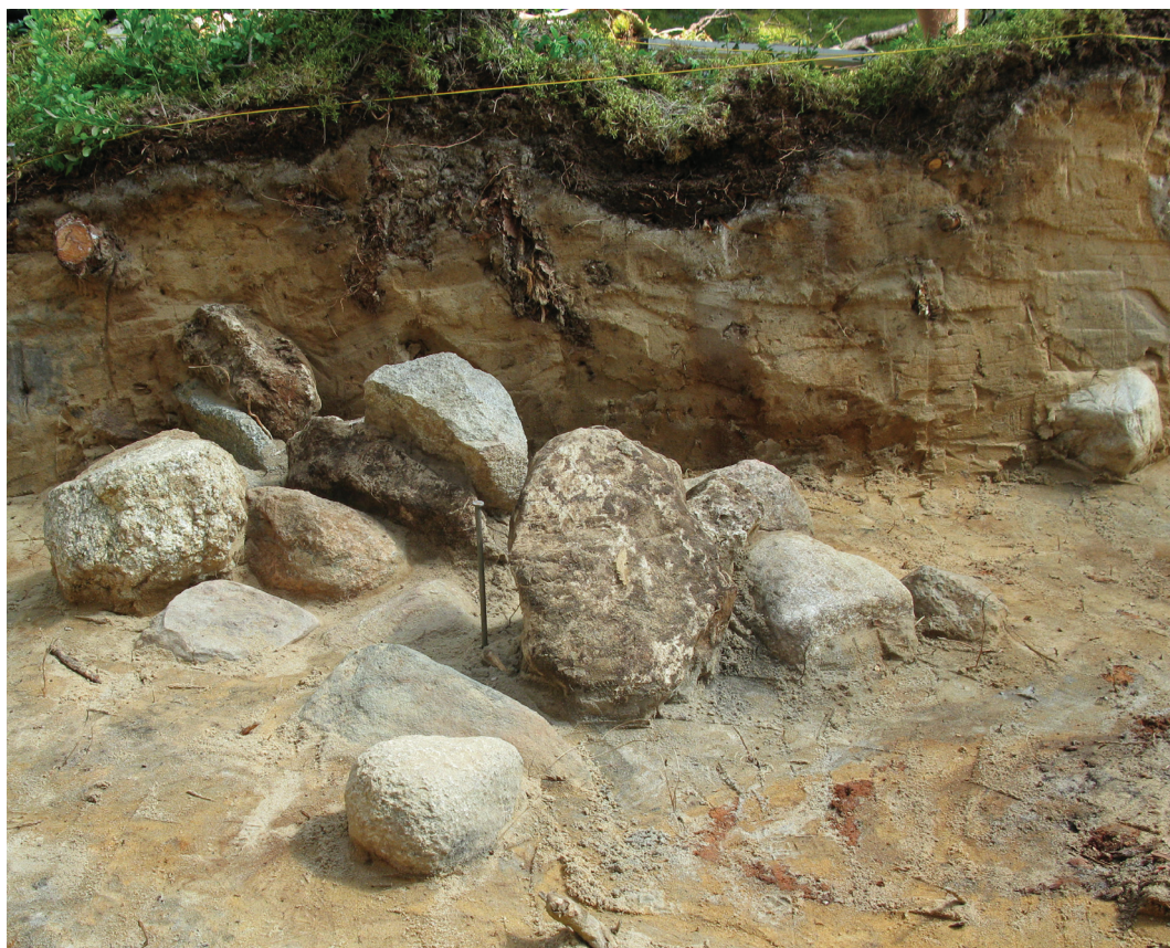
Fig. 5. Stone cluster in Loosi 2nd barrow.