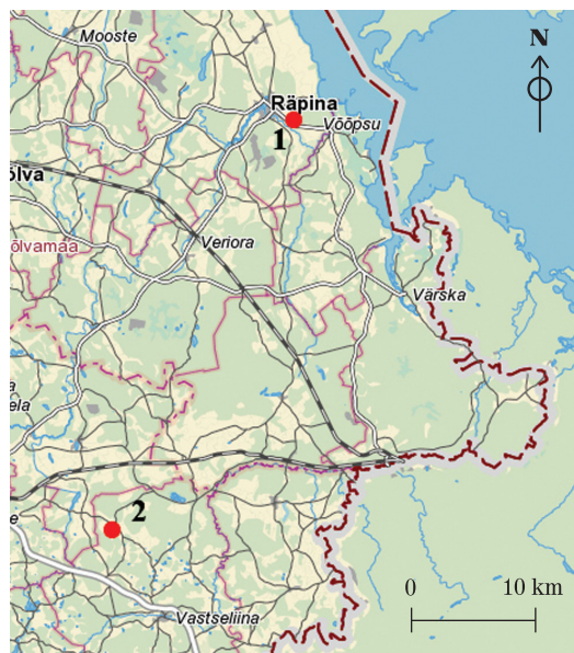
Fig. 1. Location of the barrow cemeteries mentioned in the text. 1 – Ristipalo, 2 – Loosi.

The purpose of the 2009 excavation was first of all to make sure, whether the barrow, overlapping with the area of the new planned road, though excavated in 1956, but not heaped up after the excavations, was thoroughly studied. The second aim of the work was to ensure that the new drainage ditch of the road that came dangerously