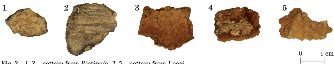
Fig. 2. 1–2 – pottery from Ristipalo, 3–5 – pottery from Loosi.

The first of the two barrows (reg. no. 13741) was 10 m in diameter and 0.7 m in height (Fig. 3: 1). In the middle of it there was a 4 m wide pit and a 1 m wide trench