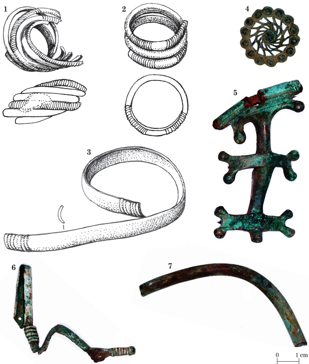
Fig. 5. Burial place of Linnakse. Artefacts from the Roman Iron Age. 1, 2 – spiral finger-rings, 3 – bracelet, 4 – disc fibula, 5 – cross-bar fibula, 6 – crossbow fibula, 7 – fragment of neck-ring.

Jn 5. Linnakse matmiskoht. Rooma rauaaegsed esemeleidud. 1, 2 – spiraalsõrmused, 3 – käevõru, 4 – ketas-sõlg, 5 – kärbissõlg, 6 – ambsõlg, 7 – kaelavõru fragment.