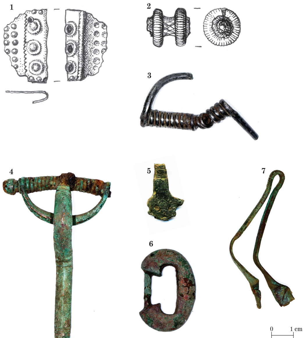
Fig. 6. Burial place of Linnakse. Selection of artefacts from the Middle Iron Age. 1 – silver sheet ornament, 2, 3 – fragments of crossbow fibula with ring decoration, 4 – crossbow fibula, 5 – fragment of crossbow fibula with star-shaped feet, 6 – belt buckle, 7 – tweezers. 1–3 silver, 4–7 bronze.

Jn 6. Linnakse matmiskoht. Valik keskmise rauaaja leidudest. 1 – hõbeplekist ehenaast, 2, 3 – rõngas-kaunistustega ambsõle nupp ja nõelapinge, 4 – ambsõlg, 5 – tähekujulise jalaga ambsõle katke, 6 – pannal, 7 – pintsetid. 1–3 hõbe, 4–7 pronks.