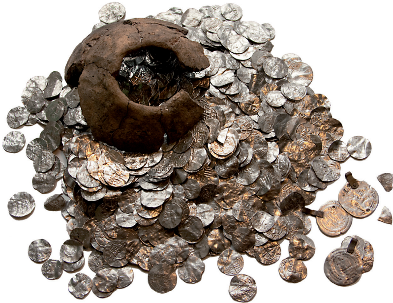
Fig. 1. Silver hoard found from Linnakse.