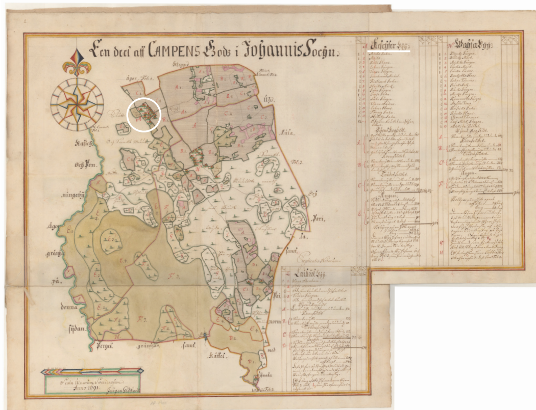
Fig. 4. The map from 1691 compiled by J. Gedhardt. Jn 4. J. Gedhardt's poolt 1691. a koostatud plaan. (EAA 1-2-C-III-47.)

that period the area used to be divided into narrow strips of field that belonged to the nearby farmers and were separated by stone fences. The stones from the fences and small clearance cairns were heaped up into the above mentioned three large piles at the beginning of the 1960s. 5 No burnt stones referring to a destroyed stone grave could be noticed among the stones in the heaps or in the rest of the soil of the eastern part of the field.