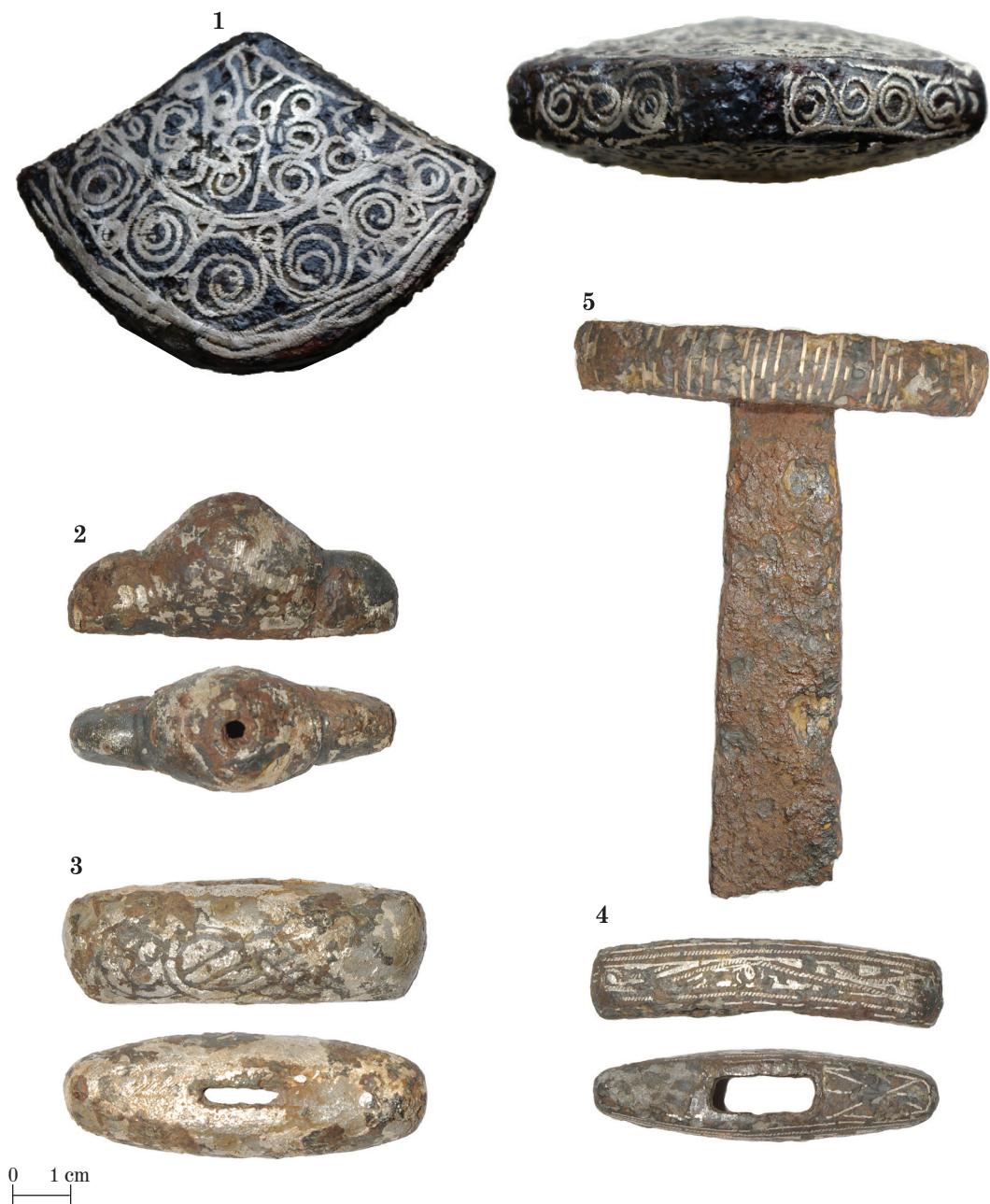
Fig. 8. Burial place of Linnakse. Swords with silver decoration. 1–2 – pommels, 3–5 – cross guards.

Jn 8. Linnakse matmispaik. Hõbekaunistustega mõõgaosad. 1–2 – mõõga käepideme nupud, 3–5 – kaitserauad. (AI 6961: 35, 41, 4, 40, 6.)