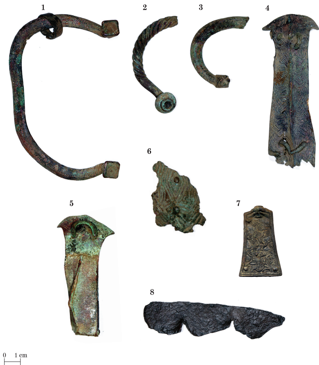
Fig. 7. Burial place of Linnakse. Selection of artefacts from the Late Iron Age. 1–3 – deformed and fragmented penannular brooches, 4–5 – fragmented crossbow fibulae, 6 – fragmented turtle-shaped brooch, 7 – plaque, 8 – fragmented sickle.

Jn 7. Linnakse matmiskoht. Valik noorema rauaaja leidudest. 1–3 – väänatud ja purustatud hoburaudsõled, 4–5 – purustatud ambsõled, 6 – kilpkonnsõle katke, 7 – naast, 8 – purustatud sirp.